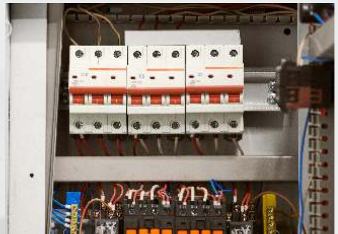
Online Contact Cleaner (to clean ELE Contacts Fom dust, moisture)/ flash over carbon remover