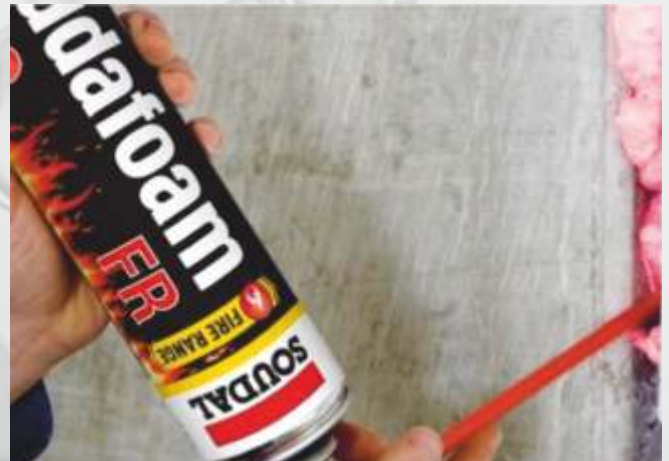
Fire Retarding PU Foam/FR grade silicone sealant