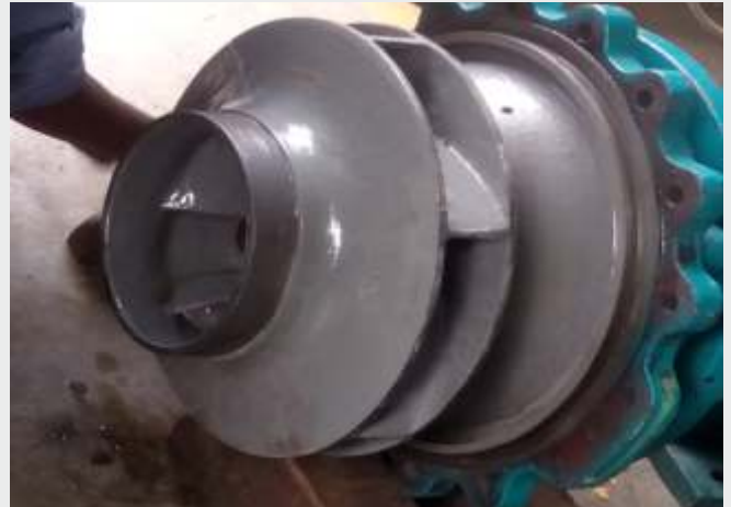
Pump impeller for dynamic balancing after coating