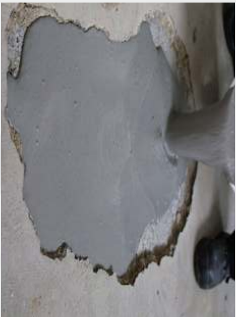
Floor Repair Compound- Cementitious & Epoxy