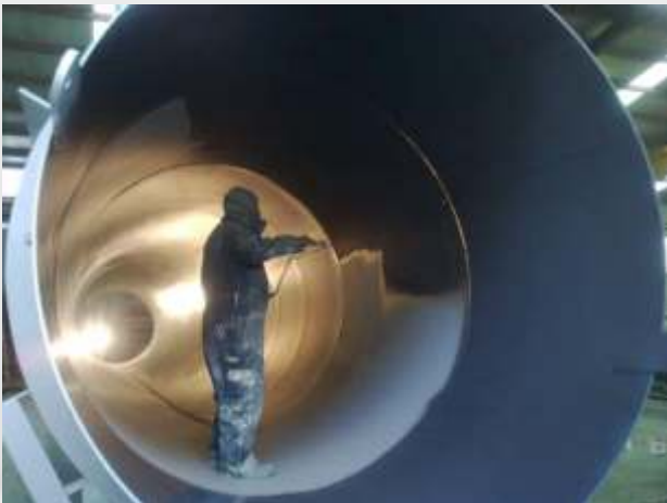
Pipeline internal coating for corrosion & erosion protection