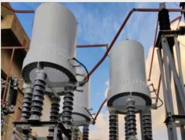
Capacitor bank anti-tracking coating