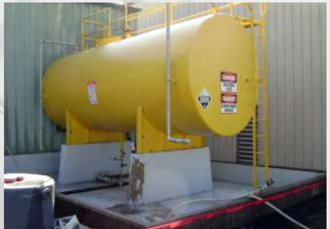
Tank internal/external chemical resistance coating Food grade (CFTRI approved) Coating for potable water Tank