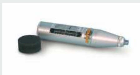
Rebound Hammer for RCC Strength