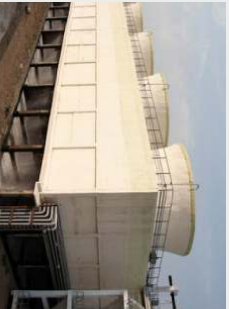
Anti-carbonation coatings Anti microbial wall coating