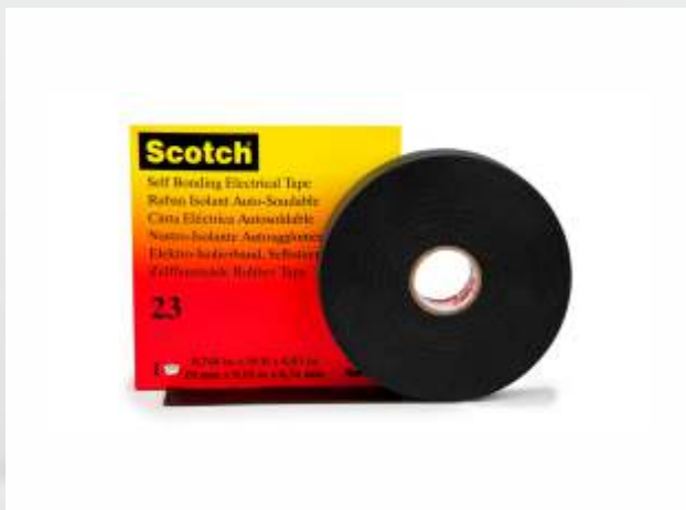
Electrical Insulating Tapes HT/LT up to 69 kV, Water & Moisture proof, Non Adhesive Rubber, Self Fusing