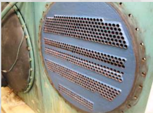
Tube sheet Coating of HE/Condenser