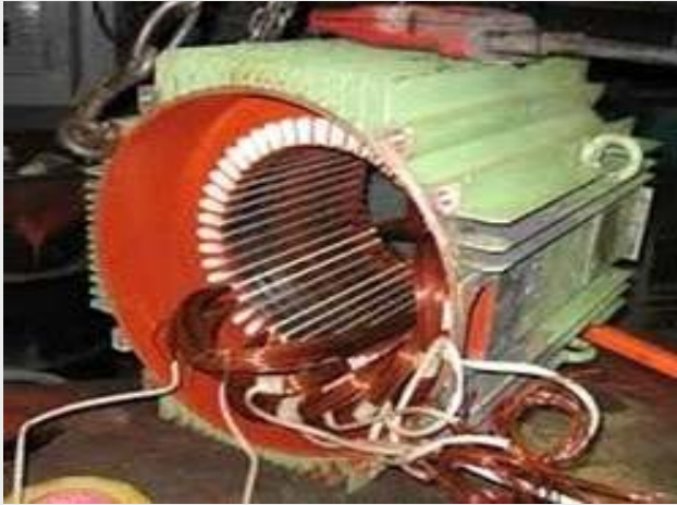
Red Insulating Varnish For Electrical Motors