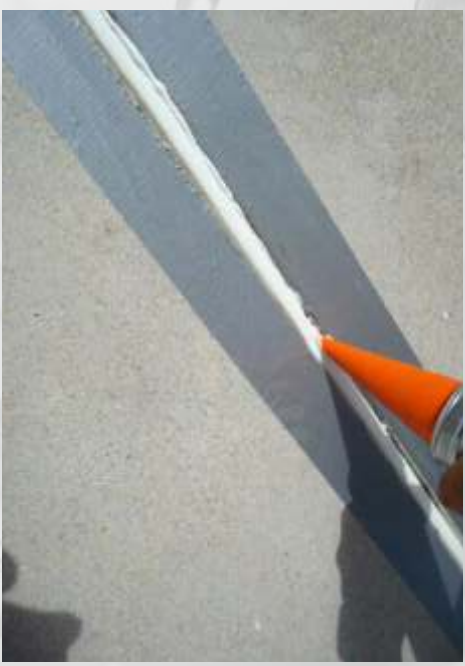
Water proofing of Expansion Joint Joint sealant - Polysulphide, PU, Hybrid