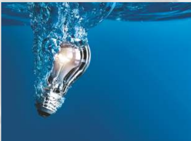
Moisture Displacer (moisture/rain proofing in JB, Ele contacts etc, protection for 3-4 months outdoor)