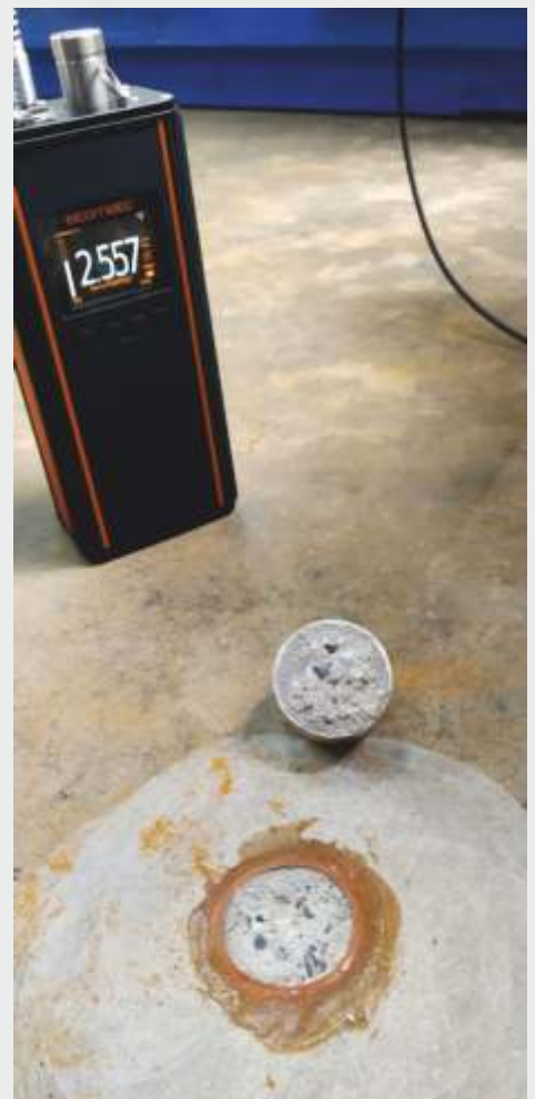
Pull off Adhesion Test