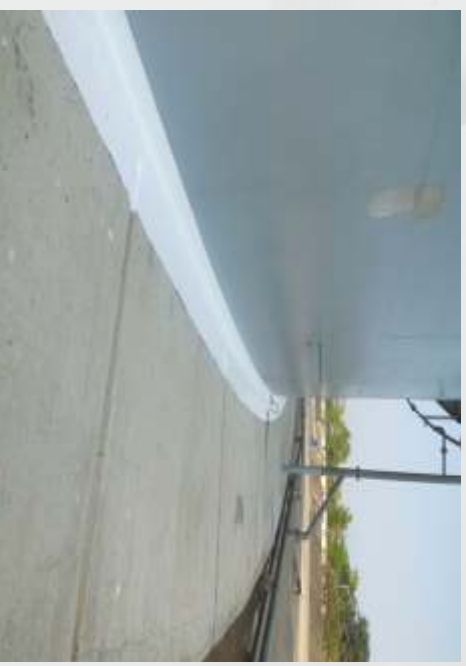
Tank Bottom Sealing for Corrosion Protection