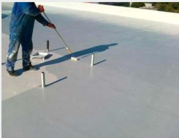
Terrace Water Proofing