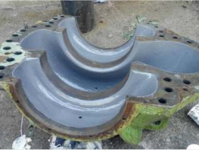
Pump coating for energy efficiency and protection