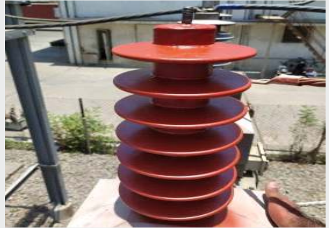
Anti-track coating/busbar insulation