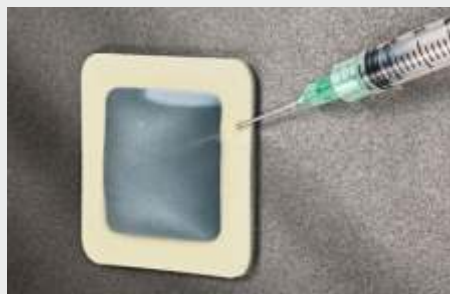
Salt Contamination Test