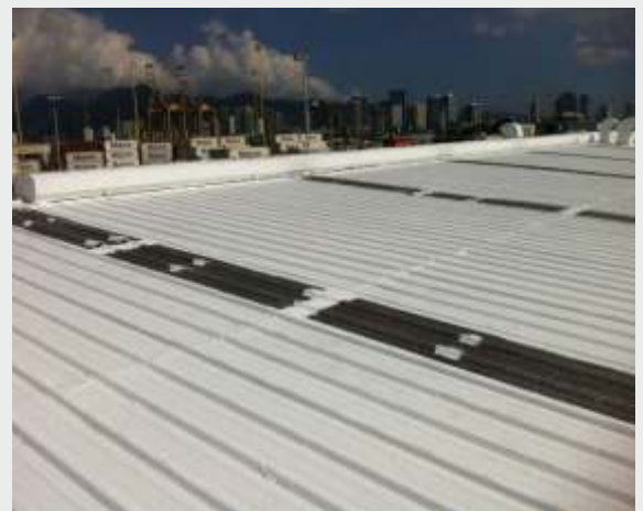
Roof Water Proofing