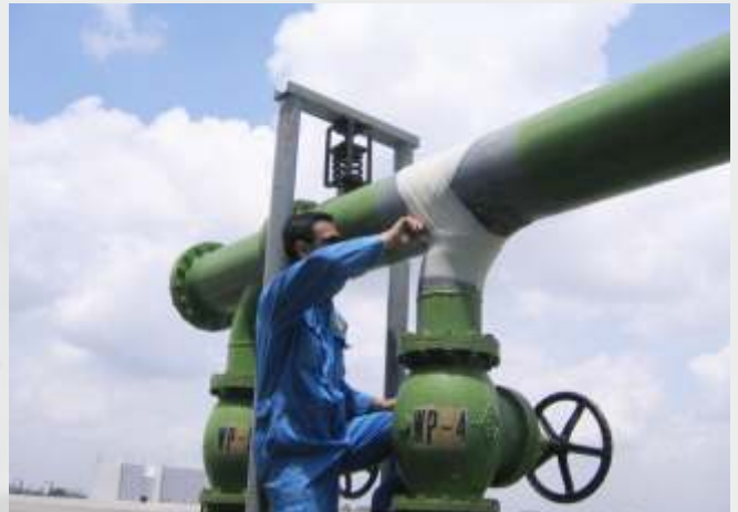
Pipeline strengthening by WRAPSEAL