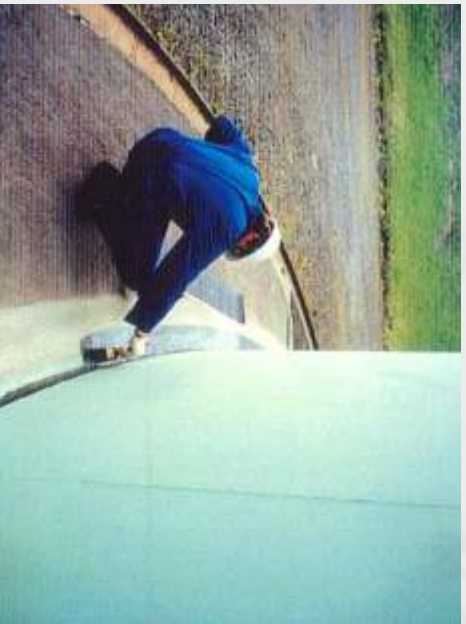
Tank Boot Sealing