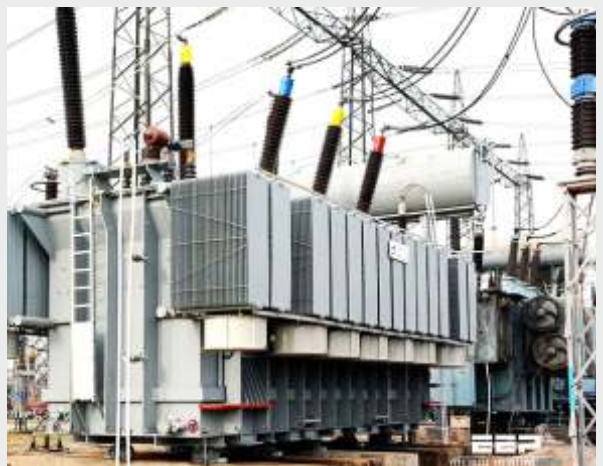
Transformer anti-corrosive coating & transformer oil leakage arresting