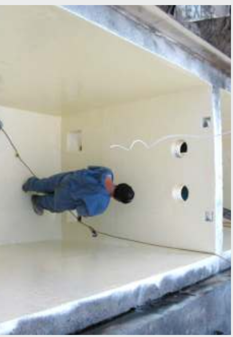
ETP/STP/WTP rcc floor/tank protective coating